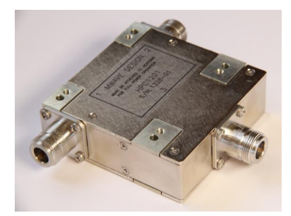
L-Band 1.5 Kw CW isolator